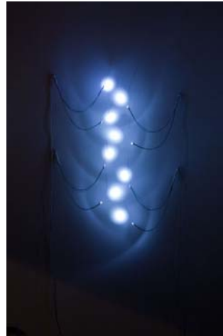
Nudibranch , 2006, white LEDs, electronics, wire, steel, 83"h x 38"w x 9"d

As in the past, Zervas continues to construct sculpture with thin fluorescent lights, LED's, wire and transformers, but now he adds LEDs and electronics to imbue the sculptures with movement. The gestures of the wires, lights, and supportive structures act as three-dimensional drawings, activating a physical space through movement and subtle shifts of light and shadow.